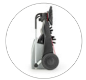
Compact dimensions: easy to store