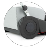
Large rear wheels