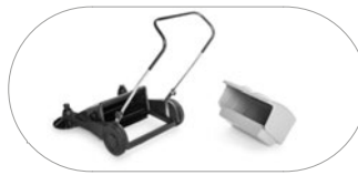
Large dirt container