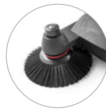
Adjustable side brushes