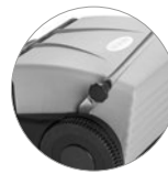
Quick stop mechanism of the handlebar