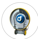
Mount for drive board and brushes